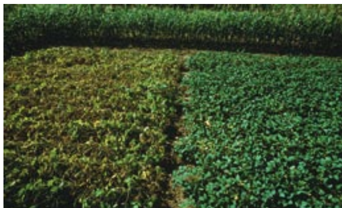
Symptoms in non-tolerant (left) and tolerant (right) soybean infected with soybean rust.

another on clothing. If clothing is exposed to spores, care should be taken to prevent the spread of soybean rust to uninfected locations.